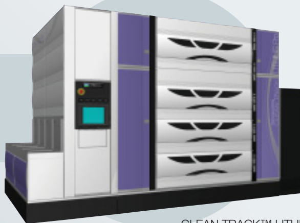
CLEAN TRACK™ LITHIUS Pro™