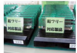
Lead-free printed circuit boards