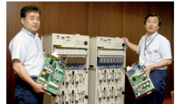
Previous thermo chiller (left) and the new one (right)

For its thermo chiller that is used in coaters/developers (system that supplies chemicals to the equipment under strict temperature control), SMC is implementing measures to comply with the RoHS directive by removing lead from the circuit boards and hexavalent chromium from the plates. By making major changes to the circuit design, the company discontinued the use of these substances without any extra cost. It completed the evaluation of a prototype in June 2006 and plans to provide a lead- and hexavalent chromium-free thermo chiller FY 2007.