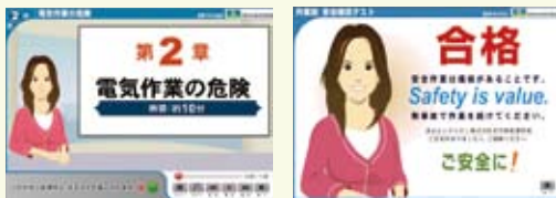
Pre-work check test and refresher training using the intranet

As a new trial beginning in fiscal 2012, we are now conducting a pre-work check test, having upgraded our previous system in which we used our intranet to verify our customers' rules and practices prior to visiting their plants. Through this test, workers are able to achieve safer working conditions by confirming safety rules immediately prior to work.