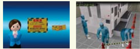
Educational tool using 3D video

electrical work and robotic moving parts, we are better able to prevent accidents before they happen.