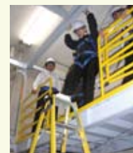
Wearing safety belts on tall structures