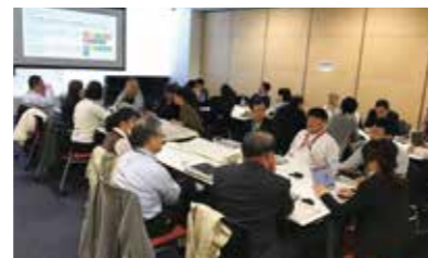
CSR Global Promotion Committee held in November 2018

TEL implements sustainability management which is integrated into the management strategy from a medium- to long-term perspective of corporate value enhancement. The company promotes CSR activities centered on the following three bodies. The CSR Management Council, the highest decision-making body regarding CSR, conducts discussions regarding the policy for the entire Group and important projects. CSR representatives from around the world participate in the CSR Global Committee, which discusses short- to medium-term CSR targets, promotion of global projects, and other matters. Representatives from each division attend the CSR Monthly Meeting, where information is shared regarding CSR activities, and which builds cooperative systems to tackle cross-division themes.